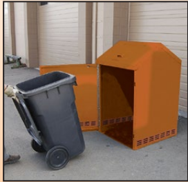
Houses 65 gallon poly cart.