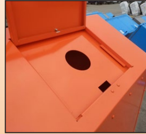
Restrictor plate under user door to control material collection.