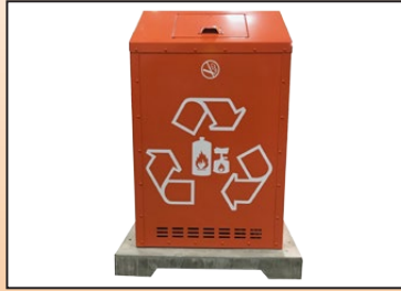
Optional concrete pad with forklift pocket to allow for ease of placement.