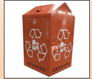
Custom decaling available.